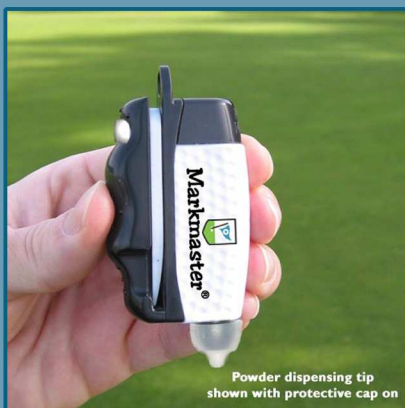
Powder dispensing tip shown with protective cap on