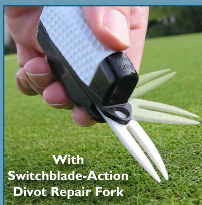
With Switchblade-Action Divot Repair Fork